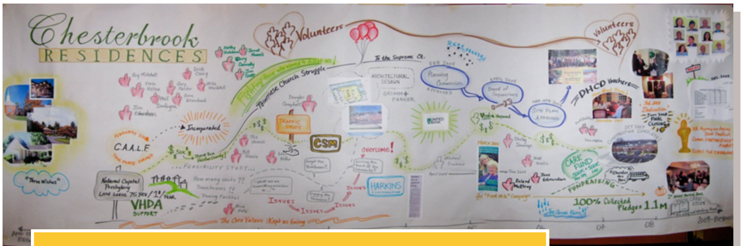
The Graphic History of an organization captured live during a Board retreat.