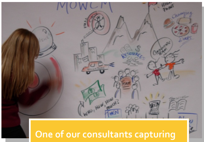
One of our consultants capturing a Visioning session live!